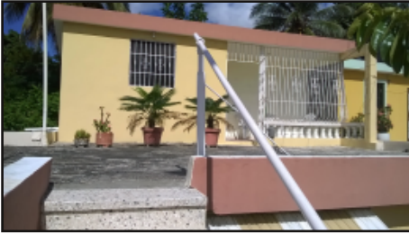
Apartment on the roof

This was our last day of meetings at the hotel. It was with joy that we embraced each other, knowing that we would be united again the next day at the local church. We moved to the home of a dear sister who had a small apartment built on top of her house for visitors. It reminded me of the Shunammite woman who built a room for Elisha to use when he was passing through (2 Kings 4:8-11).