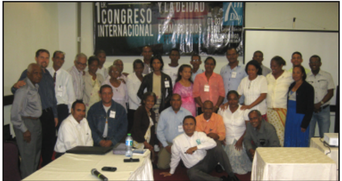
Group photo at the conference