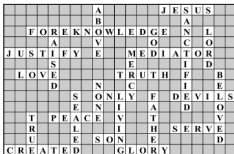
Answers to Last Month's Crossword Puzzle

Present Truth is published monthly by Present Truth Ministries . It is sent free upon request. Duplication of these papers is not only permitted but strongly encouraged, as long as our contact information is retained. Present Truth is available online at www.presenttruth.info , and you may also request to receive it by e-mail.