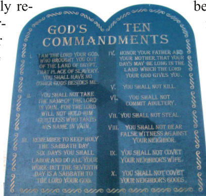
10 Commandments on display in Texas

I pray that none of you reading this paper will receive the mark of the beast. Obey God's commandments, "worship Him in Spirit and in truth" (John 4:24), and you will not receive the mark of the beast. You will go through difficulties and "shall be hated of all men... but he that endureth to the end shall be saved" (Matthew 10:22). »